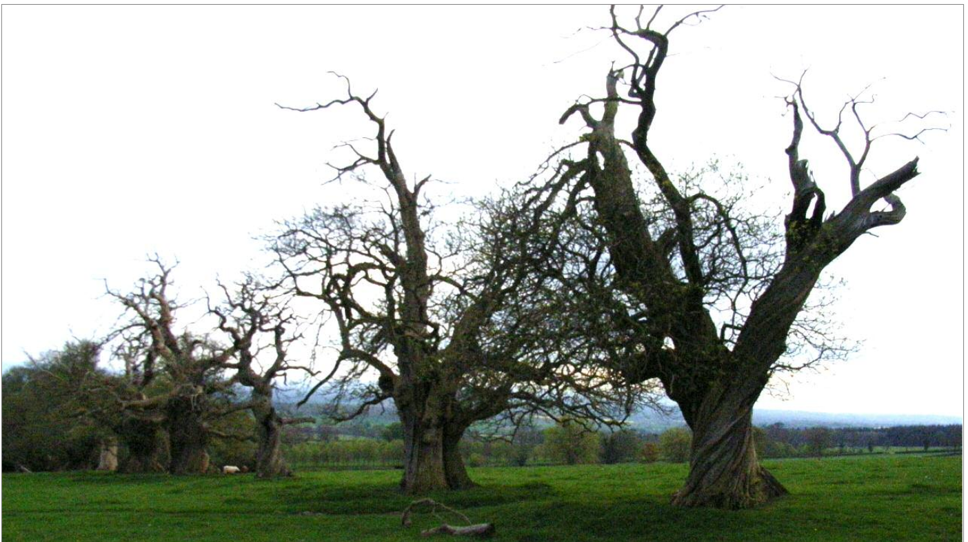
The Armada chestnuts in the grounds of Croft Castle, Herefordshire.